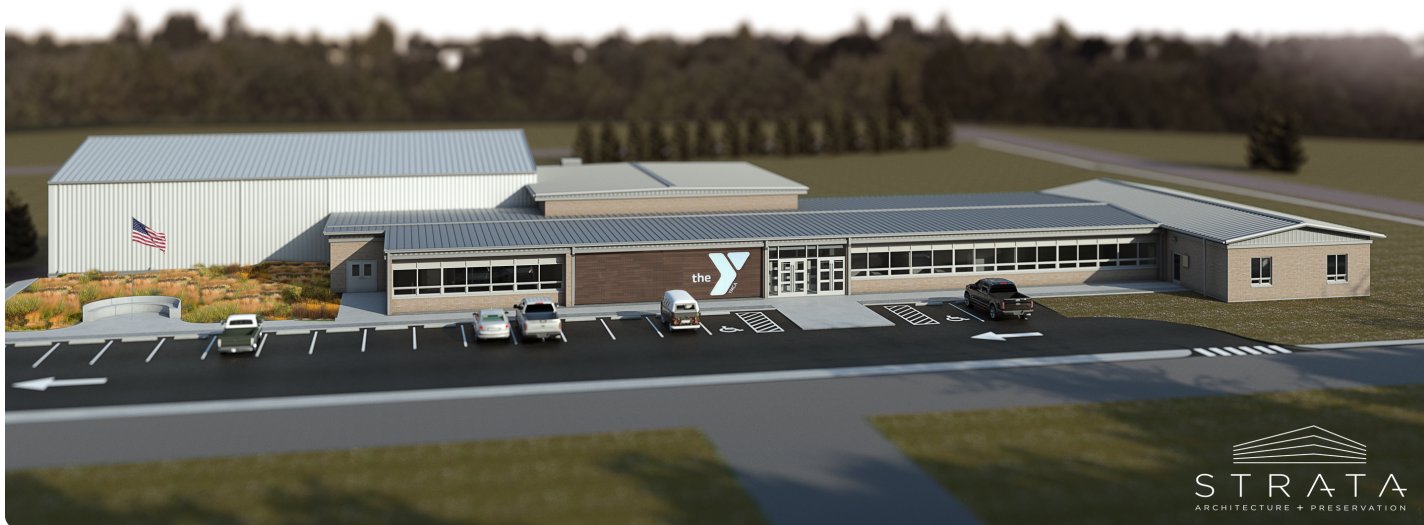
Exterior rendering depicting the remodel and large gymnasium addition to the existing Adams School building.

To put Christian principles into practice through programs that build healthy spirit, mind and body for all.