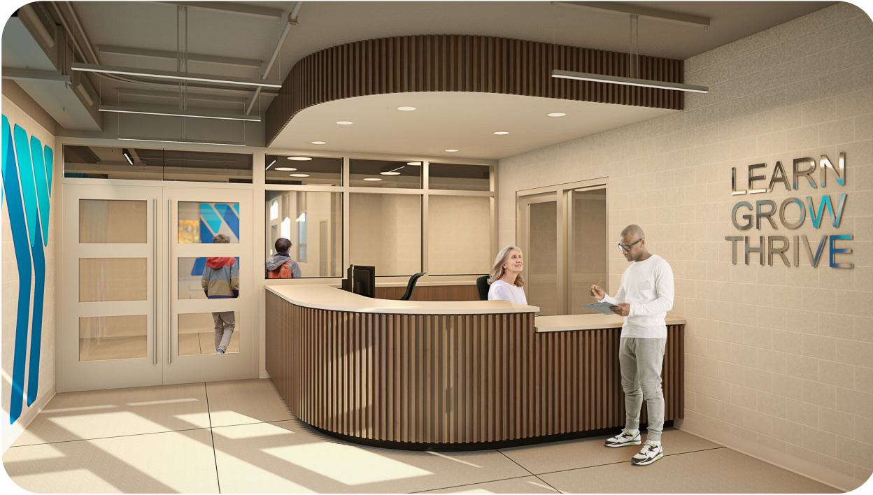
Interior renderings depicting the new check-in desk and fitness center.